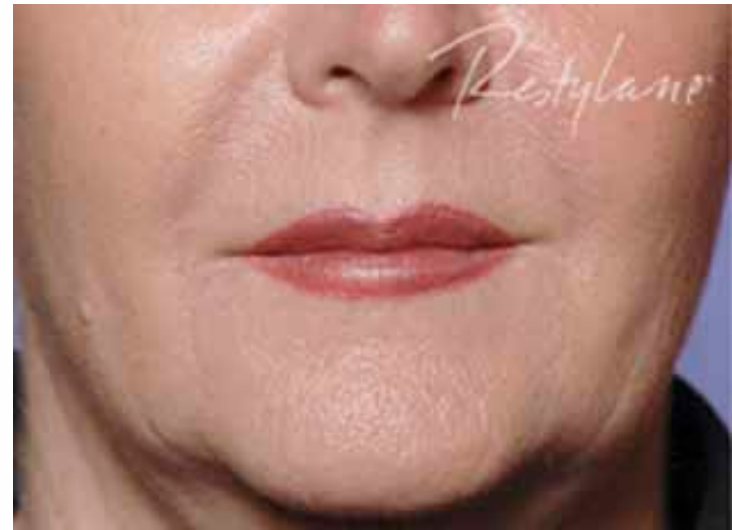
After two Restylane ® 1 mL syringes