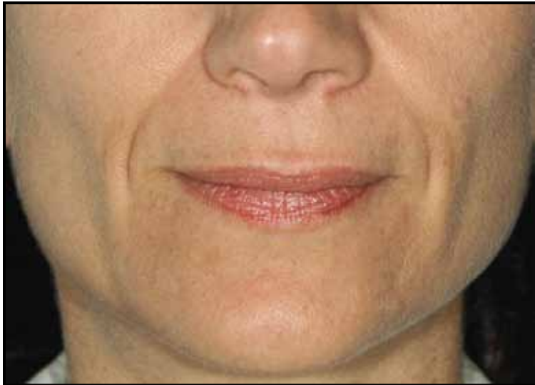
Nasolabial folds before