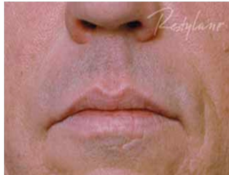
After two Restylane ® 1 mL syringes