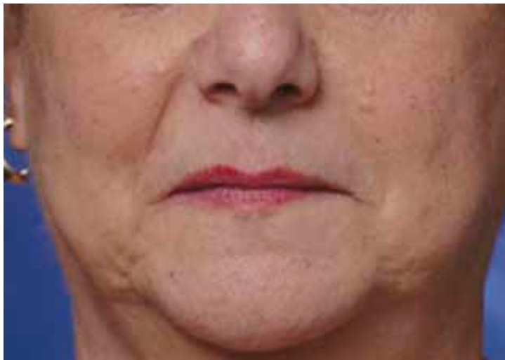
Nasolabial folds before