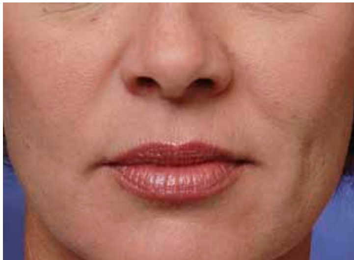
Nasolabial folds before