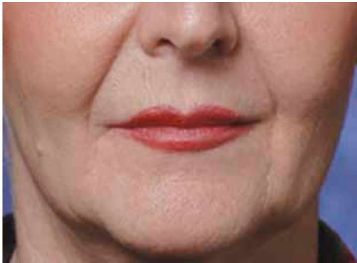
Nasolabial folds before