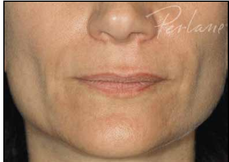
After two Perlane ® 1 mL syringes Individual results may vary