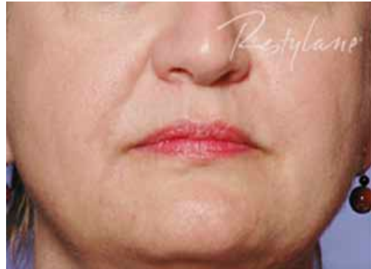
After three Restylane® 1 mL syringes