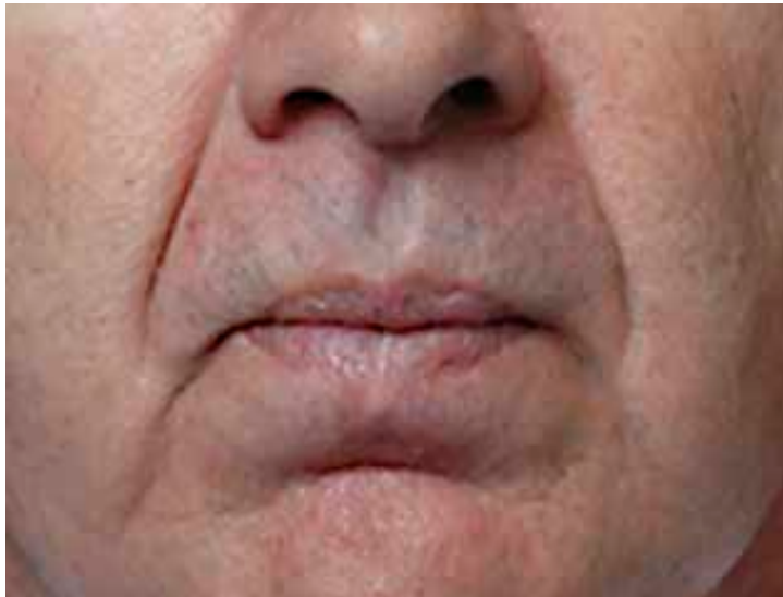
Nasolabial folds before