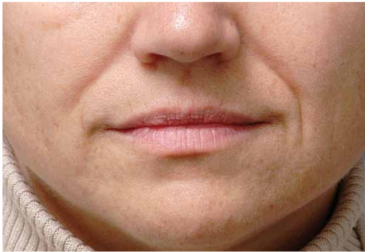
Nasolabial folds before