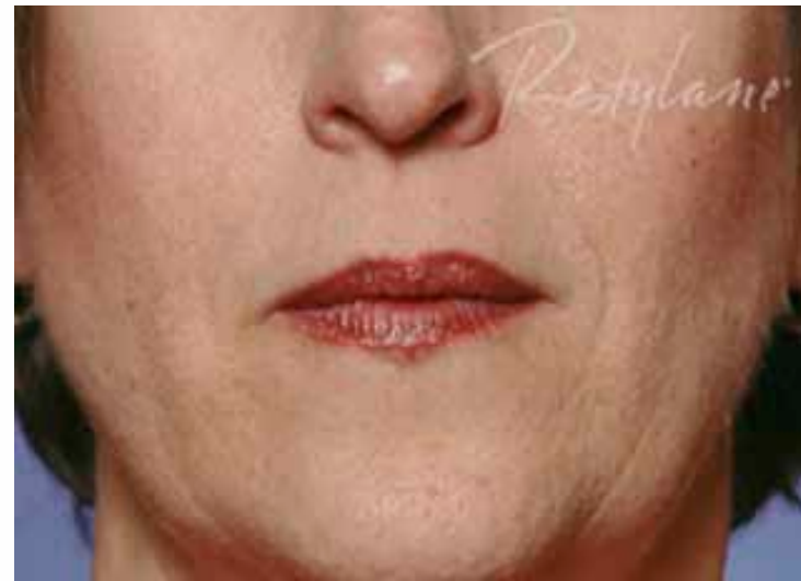
After one Restylane ® 1 mL syringe