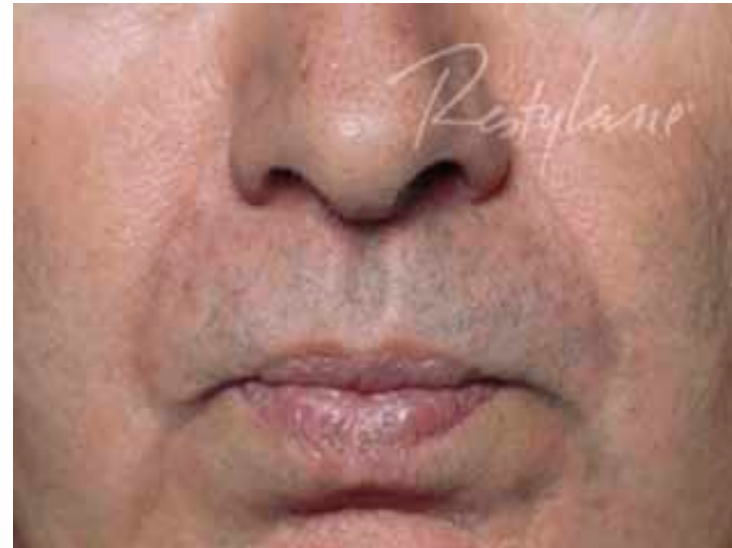
After three Restylane ® 1 mL syringes