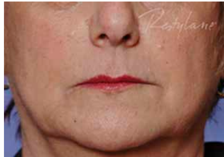
After two Restylane ® 1 mL syringes