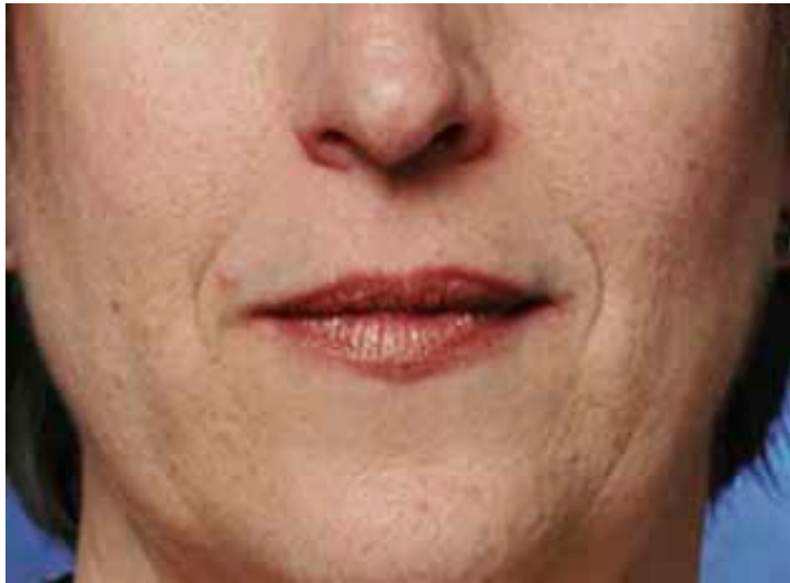
Nasolabial folds before