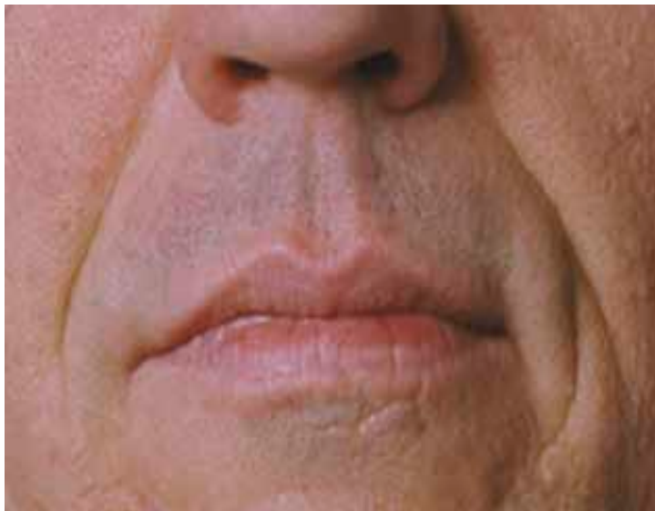
Nasolabial folds before