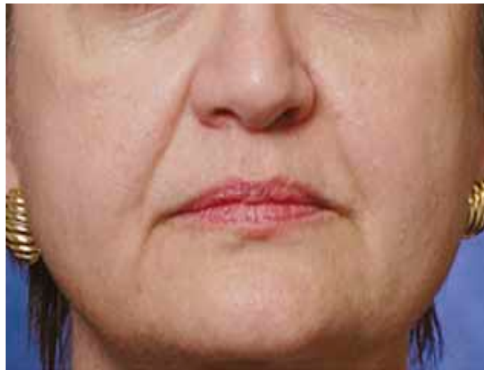
Nasolabial folds before