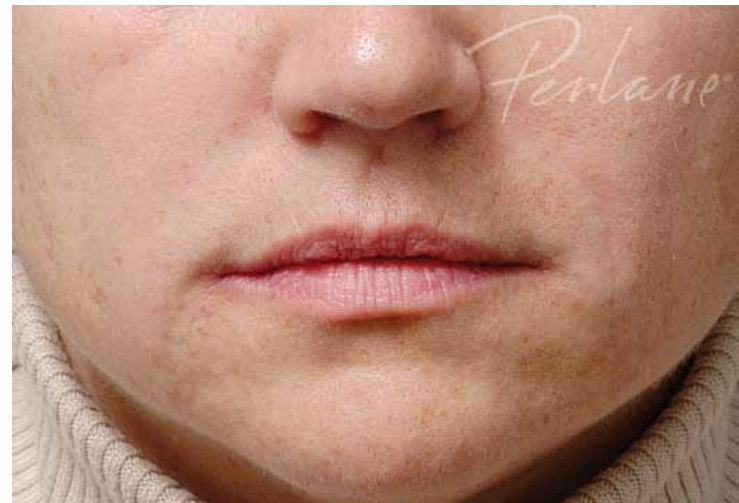
After 2.5 Perlane ® 1 mL syringes Individual results may vary

See Important Safety Information on slides 7 and 8