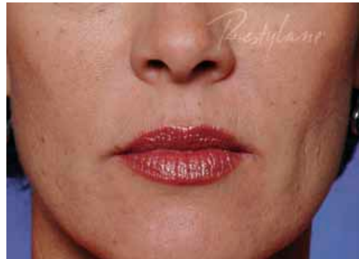
After two Restylane ® 1 mL syringes